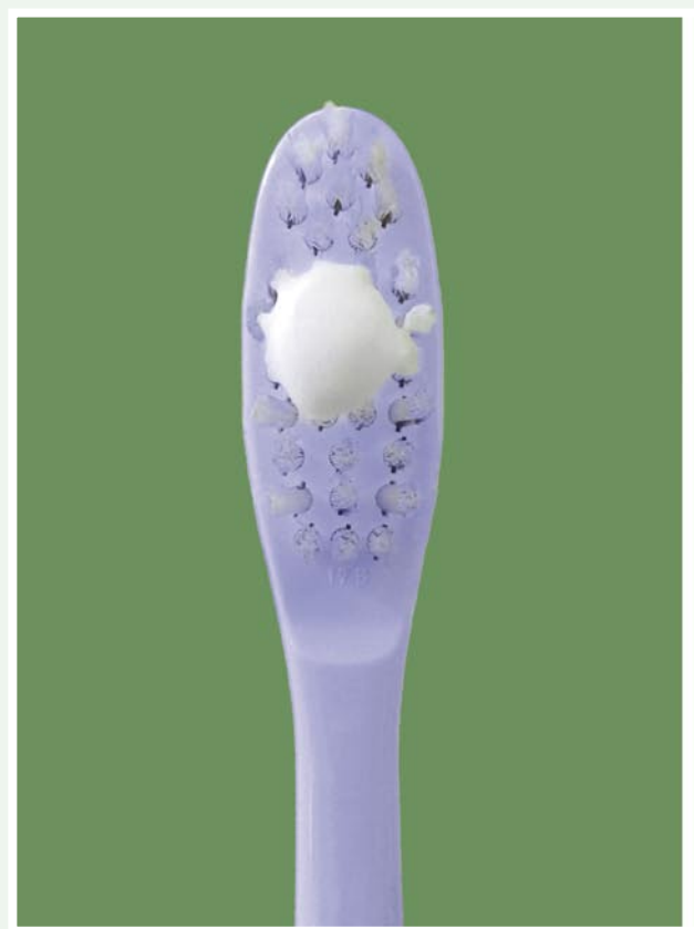
Pea-sized amount of fluoride toothpaste

"The Joint Committee on Health and Children calls on the Minister for Health and Children to direct the Health Service Executive to carry out a national study of total fluoride intake; and for the draft Terms of Reference on such study to be forwarded to the Joint Committee for its consideration before they are finalised by the Minister".